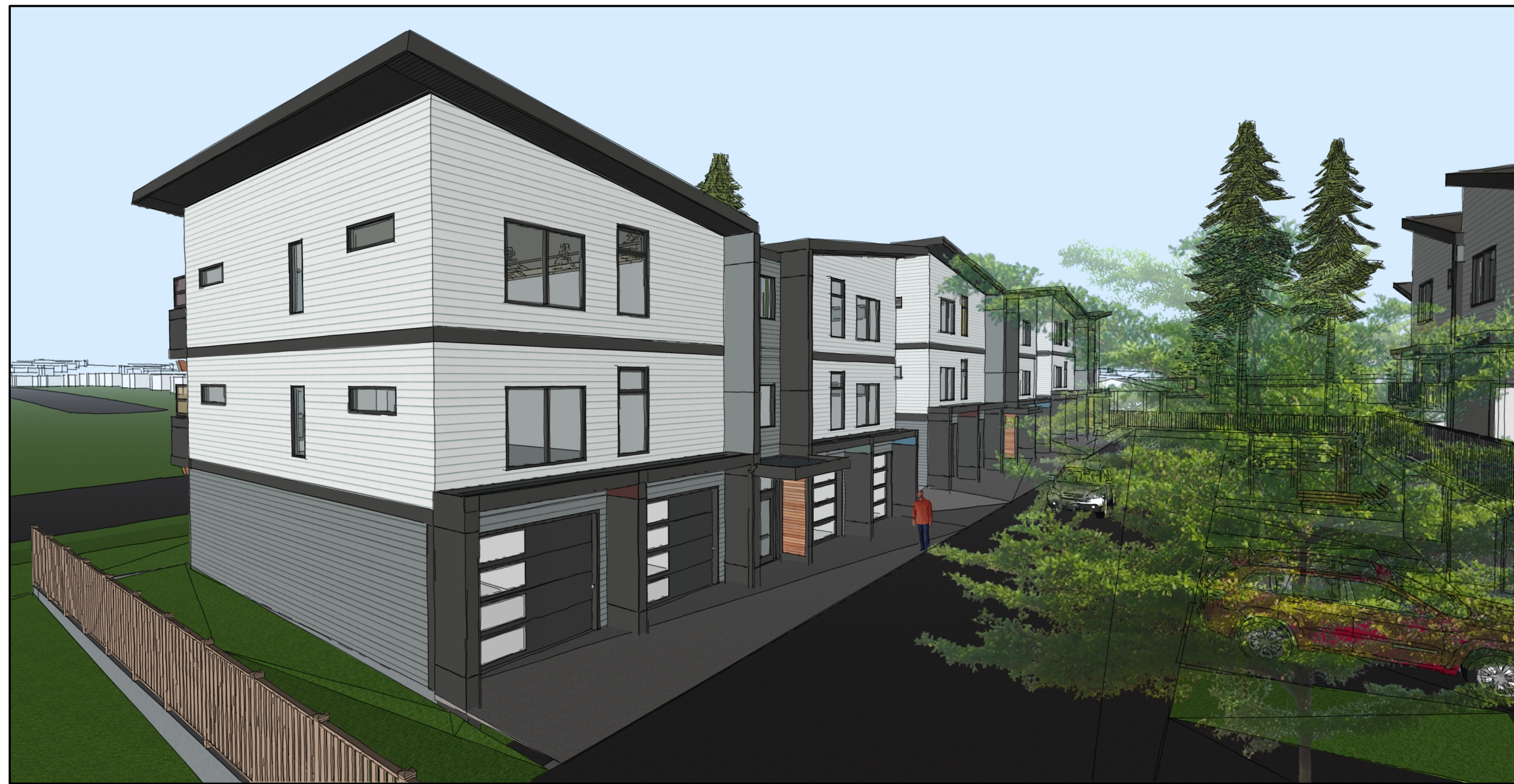
3 Building B N.T.S.