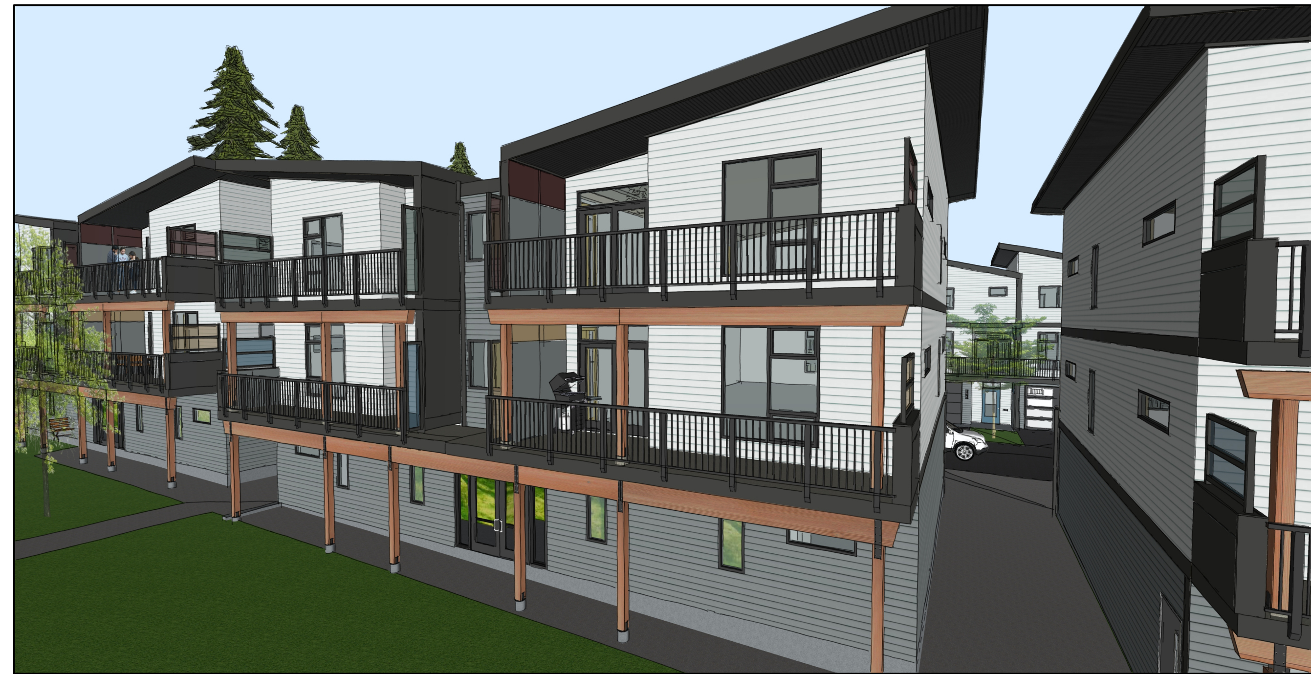
4 Building B N.T.S.