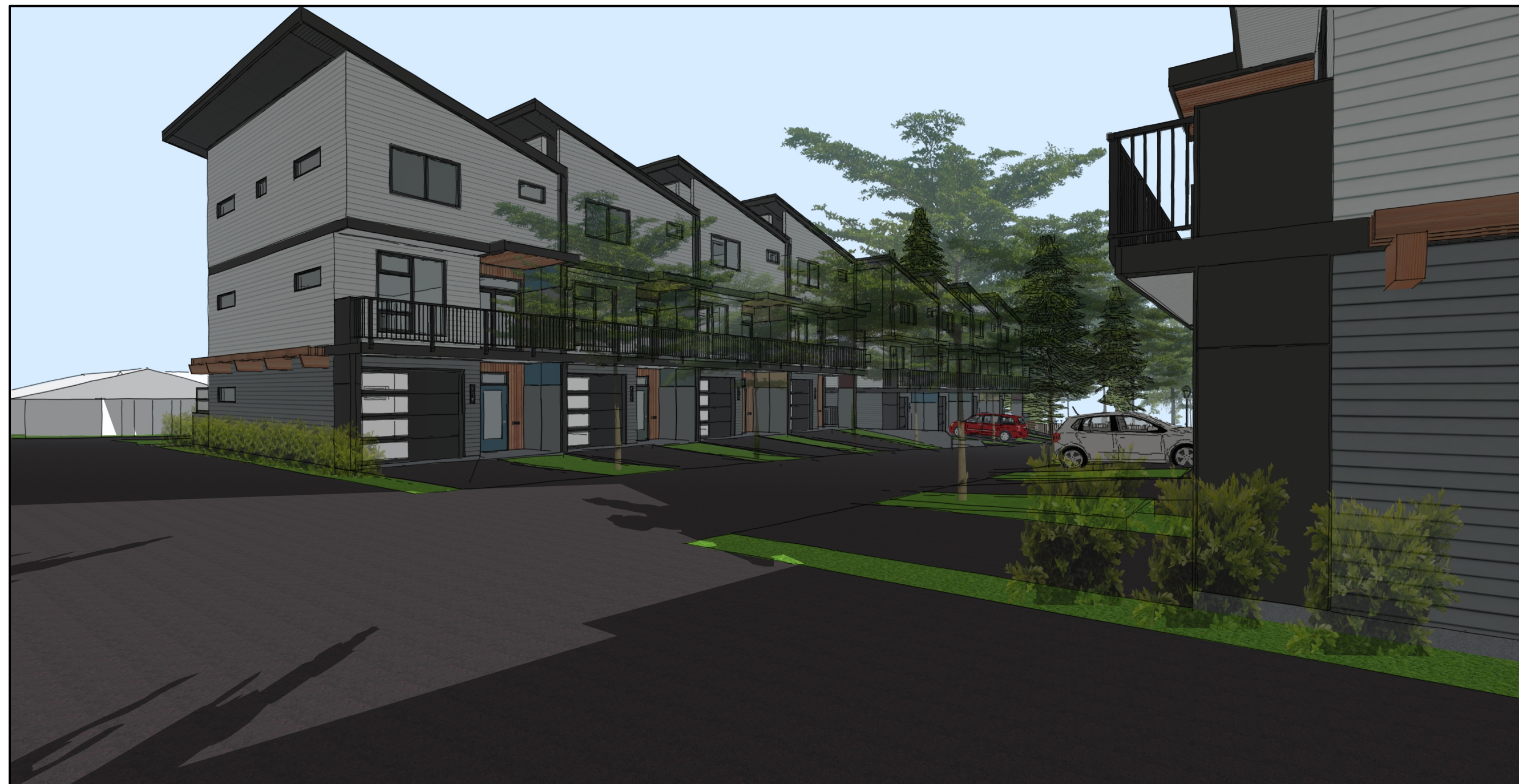
3 Building A N.T.S.