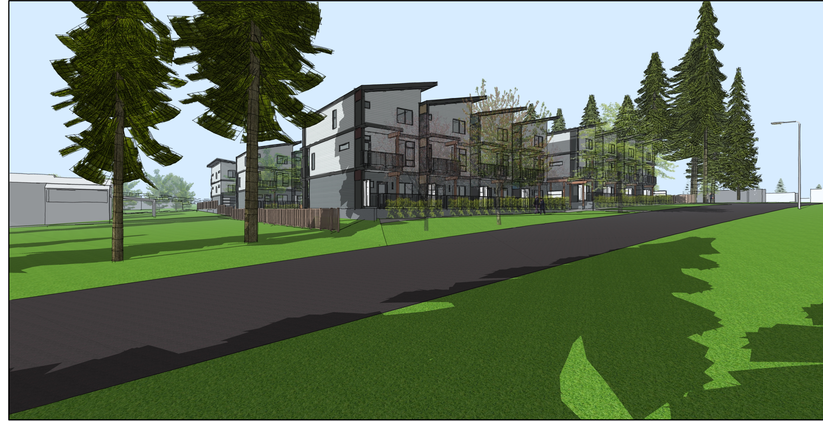
2 Building A N.T.S.