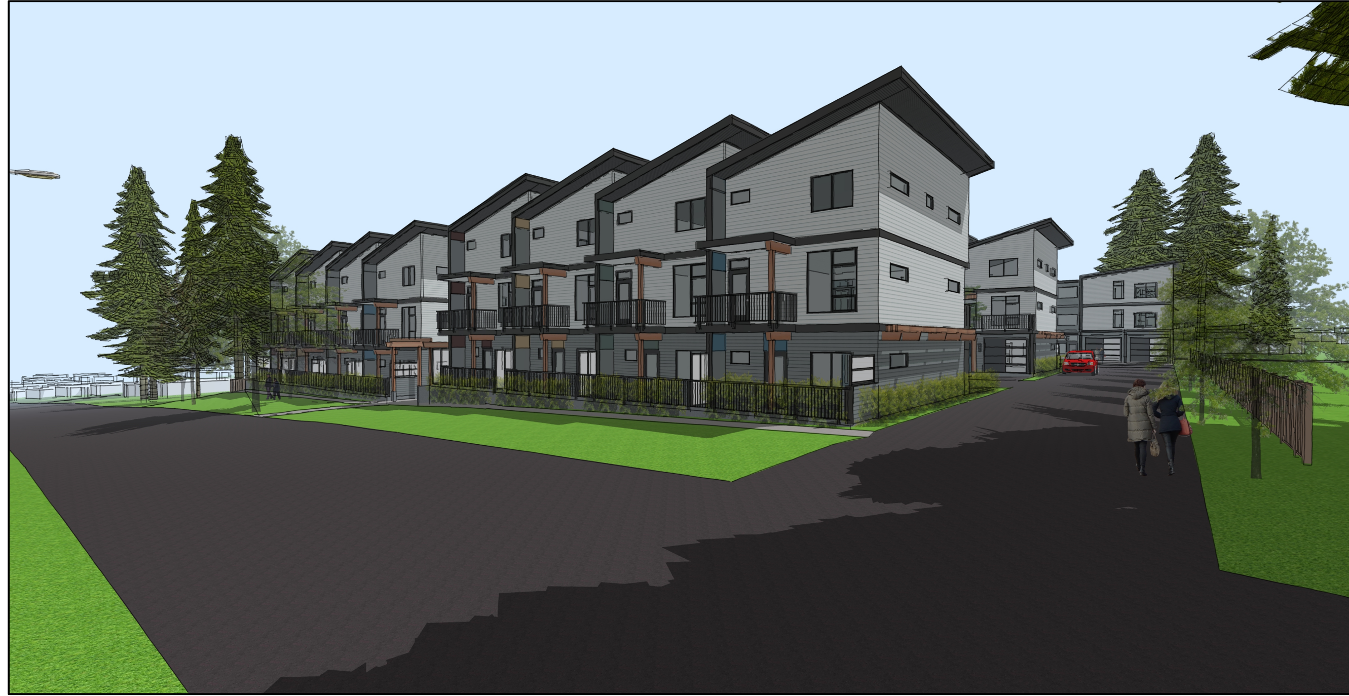
1 Building A N.T.S.