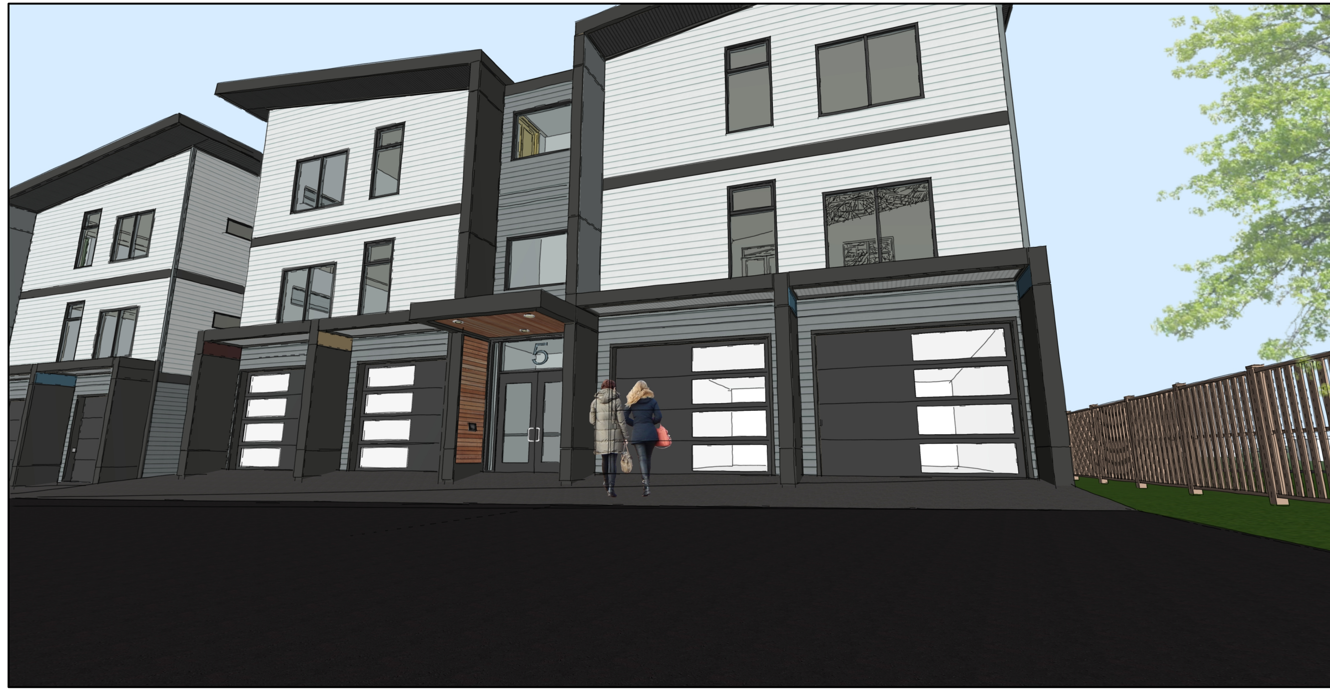
1 Building B N.T.S.